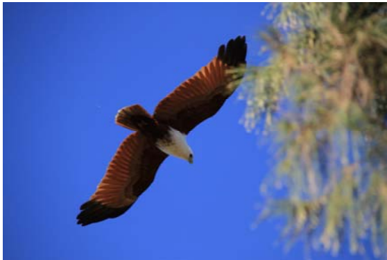
Just one of the many birds we saw in Arnhem Land