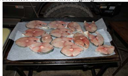
The fishing was amazing!

The birdlife throughout the trip was outstanding and we must have seen over a hundred wild buffalo! I know this is an expensive trip, but everyone agreed it was well worth the money and provided an experience that they could not achieve themselves or with any other tour company. This is one aspect of the Arnhem Land trip that I am very proud of, some companies say they "Do Arnhem Land", but when you read the fine print they are lucky to visit it for a day or two. On my trip you spend a total of 14 days in Arnhem Land and this will be increased for next year when I add extra time at the locations that this year's customers voted as their highlights!