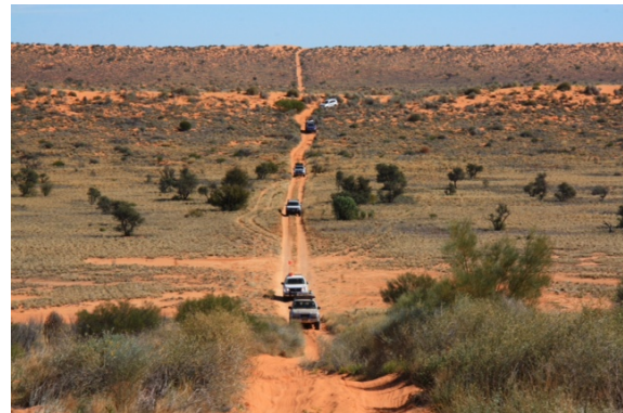
A familiar scene in the Simpson Corner Country/Birdsville tour

spend a few days exploring the beautiful Flinders Ranges. I have to feel sorry for the owners of the White Cliffs Underground motel where we had each group booked for the last night. White Cliffs remained cut off due to wet roads for a week and needless to say we never got there.