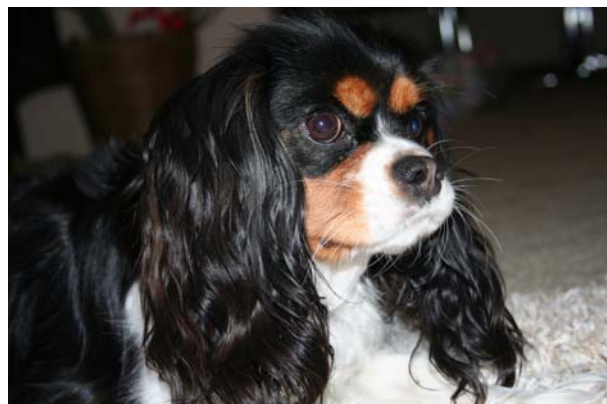
OK, so this is a photo of my dog Sasha, but she is always happy to see me.

www.4wd.net.au 02 9913 1395 info@greatdividetours.com.au