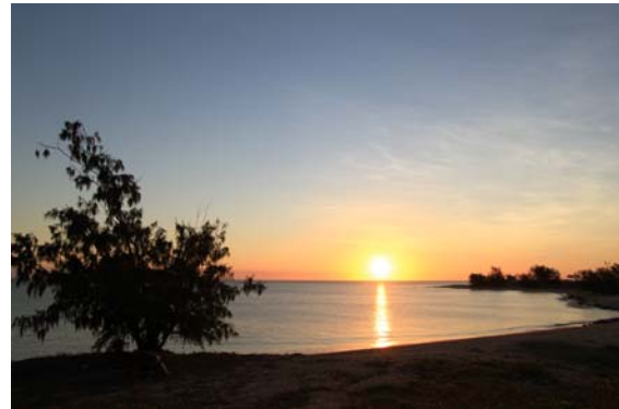
This was the view from our camp at Cobourg

to back by yours truly. This is a great way to escape Winter in the southern half of the country, I left a cold and wet Sydney in mid July and did not return until the end of September. Spending nearly two months in the top end where the minimum temp never dropped below 20 and the maximums were nudging 35 degrees!