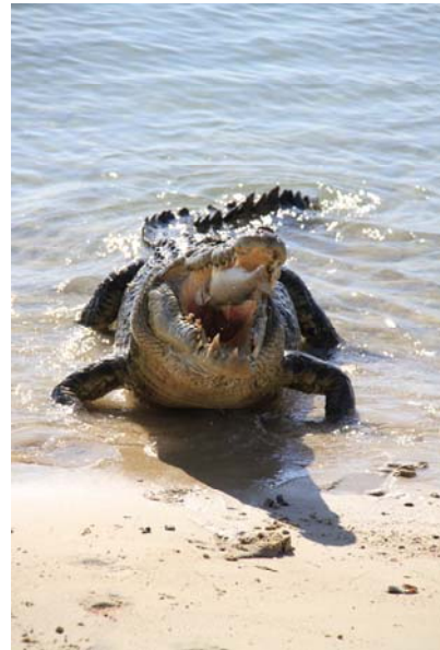
This is no Zoo, this was the beach we slept on at Bawaka!

dancers and smoking ceremonies was a real buzz. Of course there was the insane fishing and the ever present crocodiles, yes, we saw a lot of big crocs and none of them were in zoos!