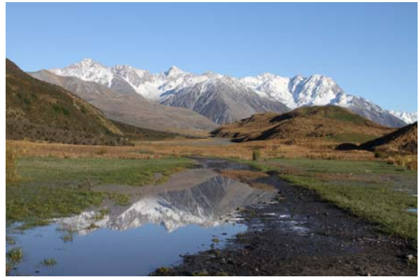
You can't beat this for scenery, join me next April in NZ!

I'm working on it for early April 2013, this will be to a totally new destination in the South Island just north of Christchurch. I've seen the photos of the country through which we would travel it looks amazing. Again if you are keen to join me on my next NZ trip please drop me an email and watch my website for more details.