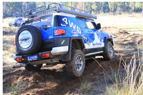
Our new track shows how traction control operates

In June I built a new 4WD test track at the Braidwood training centre. This is a track designed to demonstrate traction control aids, wheel placement and water fording ability. I'll be using it on my Advanced 4WD courses and Recovery courses.