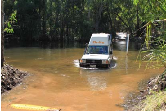
Britz are too scared to hire me a 4WD in the wet season, I wonder why?

I keep talking about flying to Darwin in January and running a wet season trip around the top end in hired 4WDs. I think the photography of the huge thunderstorms would be awesome. I've even planned a 7 day trip and decided on all the accommodation BUT, when I went to get a price on the fully equipped 4WDs, guess what? They don't hire them out during the wet season – scaredy cats if you ask me.