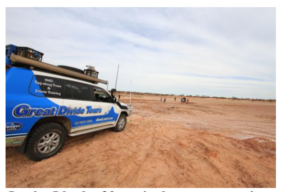
Lucky I had a 30m winch strap extension I had to positioned the 200 series so it wasn't on the clay pan to attempt a winch recovery. This meant I needed my 30 metre winch strap extension, my Dynamic winch rope doubled back through a snatch block and my bridle to connect it back to my 200, and of course about half a dozen rated shackles in the equation and three air breaks, I think the onlookers were a little amazed as to how much recovery gear I kept pulling out of the ORS drawers in the back of the 200.

I must admit, whilst winching from the driver's seat, I was hiding down low behind the A pillar in case anything let go. The strap seemed to stretch for an eternity before finally the first recovery vehicle began to move. With its driver assisting by driving, it eventually lifted out of the now half metre deep ruts in the clay pan.