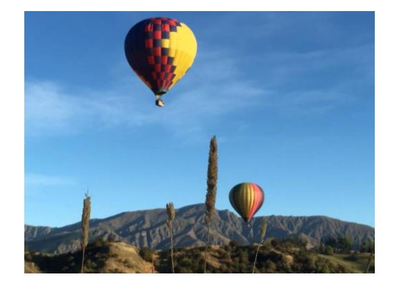
I reckon we will do this next year in New Zealand!