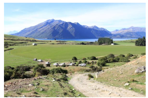
The end of our 9 hour 4wd trip to Mt Nicholas

We collected our hired Toyota Hilux's and headed off to Queenstown to start our 7 day 4wd trip. We had 8 vehicles in total plus our guide Steve Beston. This trip was quite different to the previous 6 trips I had taken over there. The highlight was the fact that we had to load our Hilux's onto a barge to transport them across Lake Wakatipu at Queenstown, this was then followed by a 9 hour 4wdrive trip to cover just 45 k's of breathtaking mountain and valley tracks.