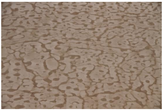
Amazing patterns in the Lakes surface