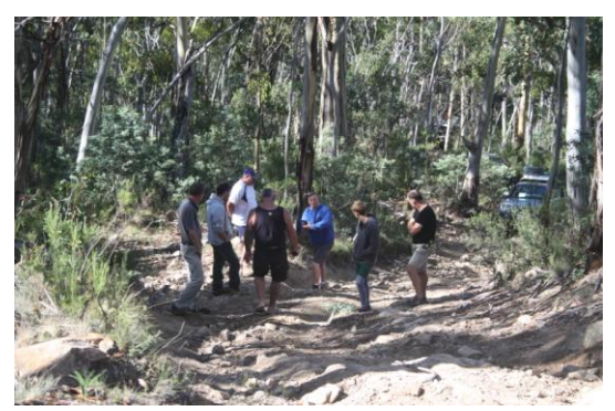
Track assessment on the Snowy Trip

crew had a lighter load as some items had escaped through an [self] opening canopy rear window!. We had to go back and collect all the 'litter' since we are so eco friendly. Sadly the back window didn't survive a later nudge from the 'chilly bin' in the back of the ute, whoops. A reminder to all that loads need to be restrained even in a ute tray. The following day we ascended a tricky section of the Cobberas Track after reviewing available lines, required driving techniques and tyre pressures. Everyone made it. Phew, and away we went.