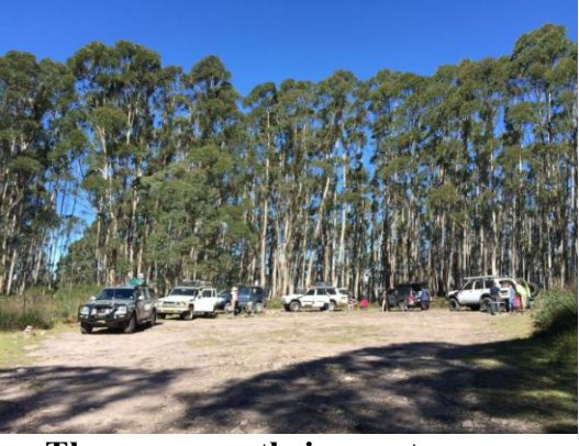
The group on their way to camp

Well Ty, you certainly have the passion for 4wdriving and camping and fortunately not the verbal diarrhoea that your Uncle suffers from!