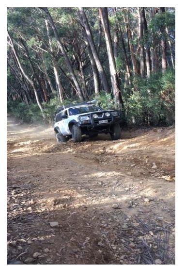
Lots of flex on the Ridges and Rivers tour.